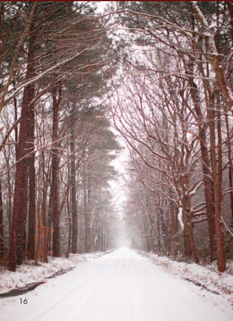
▼ Snow-Covered Lane by Caitlin Finchum, Bloxom