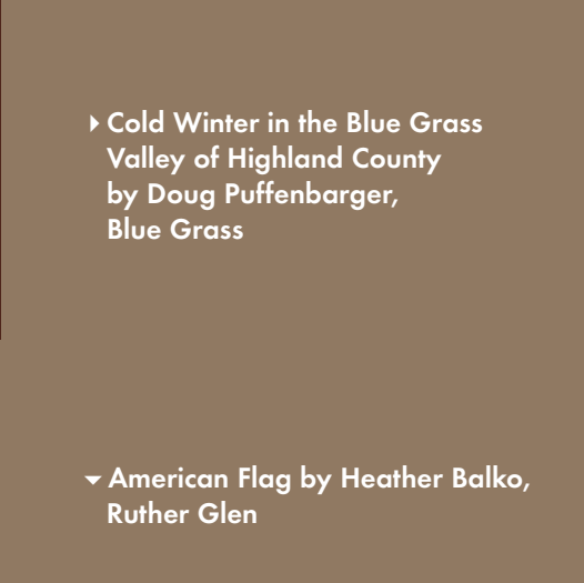
▶ Cold Winter in the Blue Grass Valley of Highland County by Doug Puffenbarger, Blue Grass