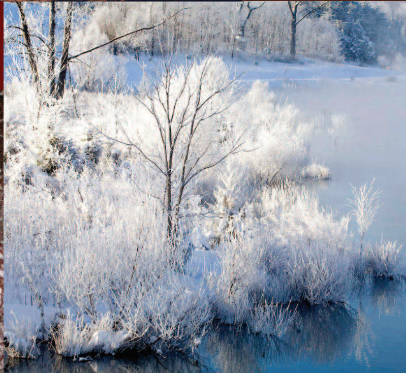
▲ Snowy Pond by Dan Jones, Fincastle