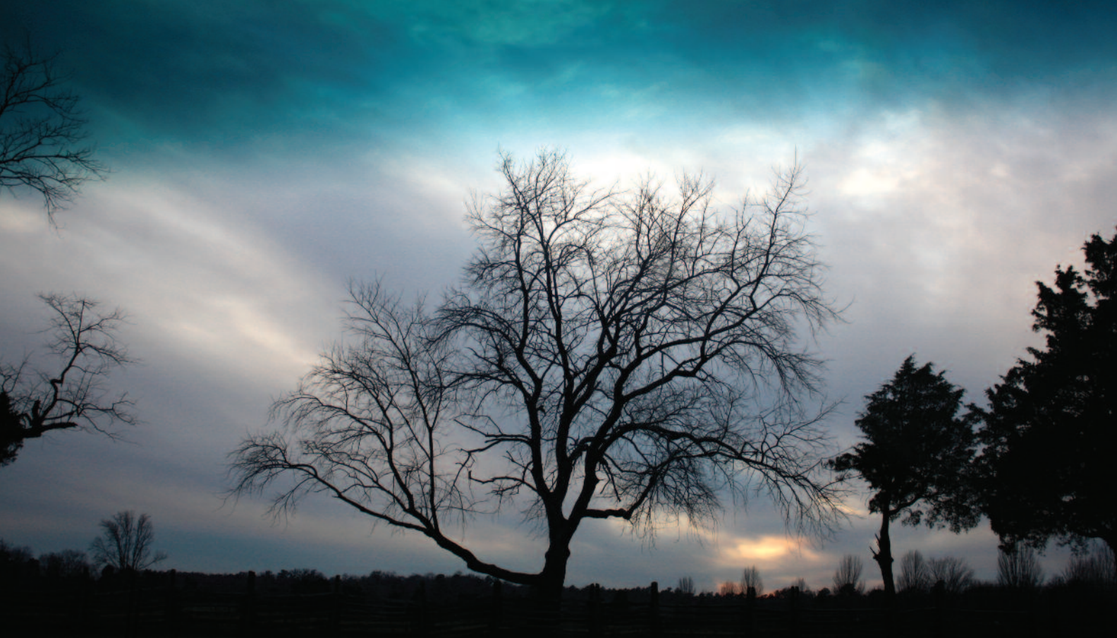
▲ Serene Winter Sky by Gloria Sharp, Colonial Beach